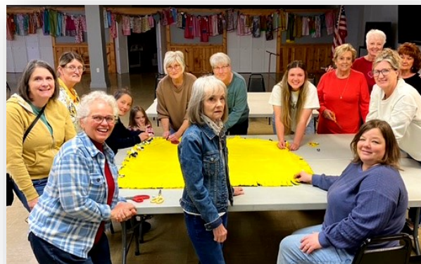
The Tuesday morning Ladies Bible class recently made blankets for special needs students at Indian Hills Elementary.